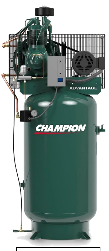
VR5-8 Shown Above

5hp Delivering 17.3cfm @ 175psig @ 710rpm