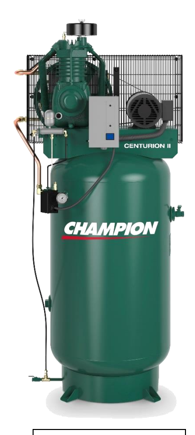
VRV5-8 Shown Above